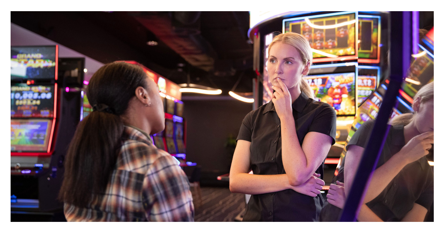
New Responsible Conduct of Gambling course material