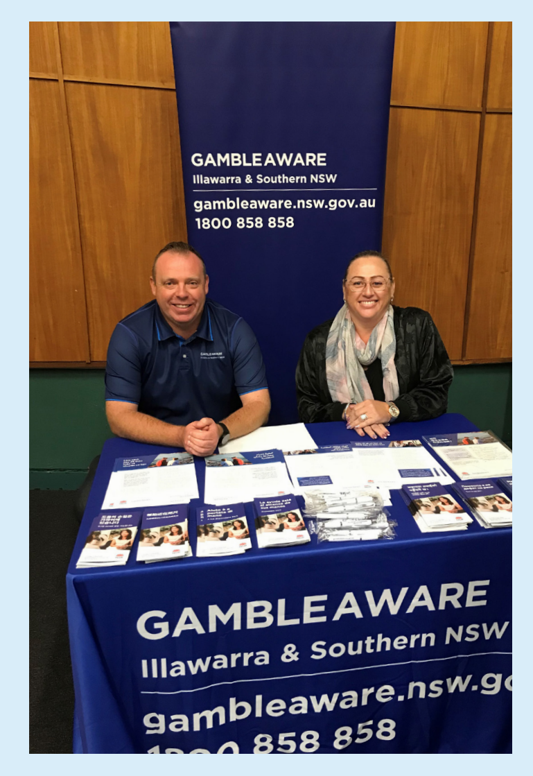
Representatives of GambleAware Illawarra and Southern NSW at the Shellharbour Liquor Accord meeting