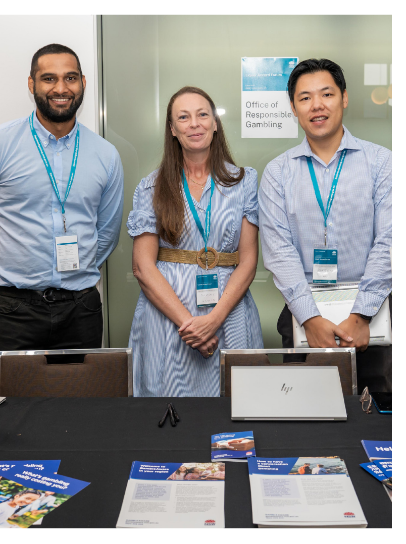
Office of Responsible Gambling staff at the Sydney Liquor Accord Forum

We lead and influence stronger gambling harm prevention and minimisation culture and practice by government, industry, community, and other stakeholders.